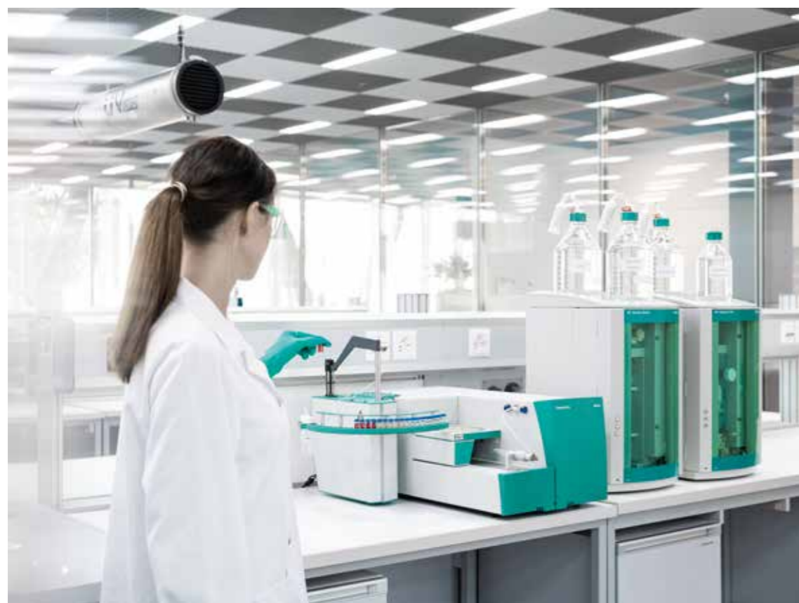
The 930 Compact IC Flex can be used to analyze gaseous, liquid, and solid samples. The Combustion IC system shown can be used for differentiated determination of the halogens and sulfur in combustible samples, e.g. plastics, raw or end products in the petroleum industry, samples from waste management or electronic components.

Furthermore, low detection limits also make the instruments in the 930 Compact IC Flex family an excellent choice for routine analysis in power plants with detection limits down to trace levels. And finally, the compact ion chromatographs from Metrohm are not only suitable for routine analysis in the petrochemical industry but also for the quality monitoring of alternative fuels, e.g. bioethanol and biodiesel.