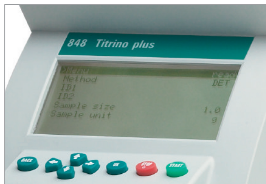
Everything at a glance – the large display of the 848 Titrino plus.