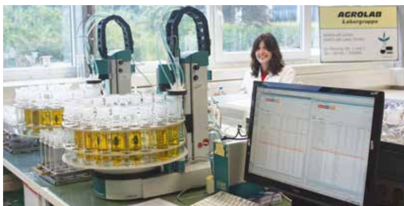
Fully automatic determination of the COD value at Agrolab Bruckberg with two 855 COD Robotic Titrosamplers