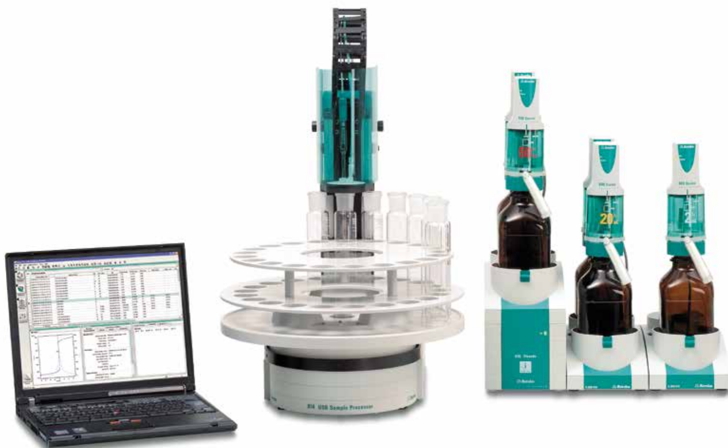
The MATI 12 system for fully automated COD determination

Manual determination of the COD value involves a great deal of work and, because the individual manual steps are difficult to reproduce, usually means inaccurate results. Metrohm resolves these problems with a fully automated system.