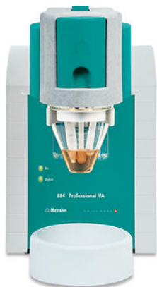
Figure 1. 884 Professional VA manual for MME.

Add 10 mL oxidized sodium chloride brine sample and 2 mL of ultrapure water into the measuring vessel. The determination of iodide is carried out with the 884 Professional VA (Figure 1) using the parameters specified in Table 1. The concentration is determined by two additions of iodate standard addition solution.