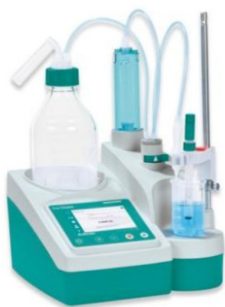
Figure 1. Eco Titrator equipped with a Ca-ISE electrode for the determination of \text{Ca}^{2+} in aqueous solutions.

The sample is titrated with EDTA solution until after the equivalence point.