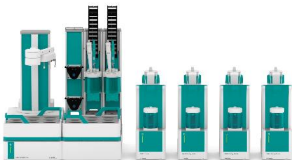
Figure 1. Fully automated system consisting of an OMNIS Sample Robot S, OMNIS Dosing Modules, and an OMNIS Advanced Titrator equipped with an Optrode.

The determination is carried out on an automated system consisting of an OMNIS Sample Robot S, OMNIS Dosing Modules, and an OMNIS Advanced Titrator equipped with an Optrode (Figure 1).