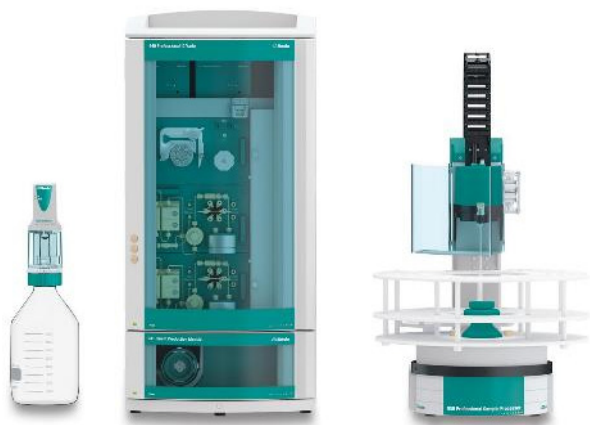
Figure 1. Instrumental setup including a 940 Professional IC Vario ONE SeS/PP/HPG, 858 Professional Sample Processor, and an 800 Dosino for Dosino regeneration of the Metrohm Suppressor Module (Metrohm Dosino Regeneration).

Samples and standard solutions were injected directly into the IC using an 858 Professional Sample Processor (Figure 1).