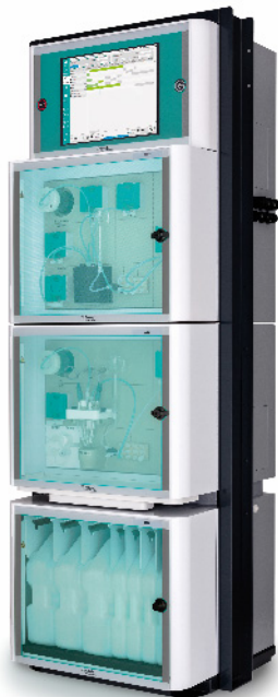
Figure 2. The 2060 TI Process Analyzer is suitable to monitor several critical parameters in nuclear pressurized water reactors.

Other process applications related to the water circuits of energy producers include silica, sodium, nickel, zinc, calcium, magnesium, and chloride. Reliable measurements of these critical parameters are possible with the 2060 TI Process Analyzer from Metrohm Process Analytics (Figure 2).