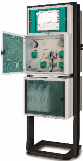
Figure 3. 2060 XRF Process Analyzer.

Additionally, gold and other metals can be monitored with the 2060 XRF Process Analyzer (Figure 3). Utilizing Energy Dispersive X-ray Fluorescence (EDXRF) technology, this online process analyzer provides exceptional sensitivity when measuring gold in the stripping solution in almost real-time.