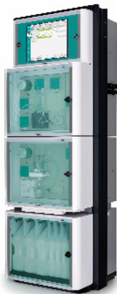
Figure 2. 2060 TI Process Analyzer.

Cyanide can be determined in several ways with the 2060 TI Process Analyzer (Figure 2). Free cyanide is analyzed by direct titration or photometric detection depending on the concentrations involved. For more complex total cyanide and WAD determinations, the 2060 TI Process Analyzer can be equipped with an array of digester, condenser, caustic absorber, and photometer modules to guarantee full recoveries of cyanide from complex metal cyanide solutions.