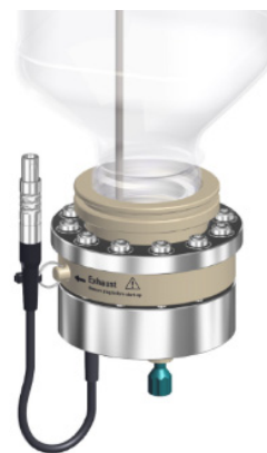
Figure 2. The 948 Continuous IC Module, CEP automatically produces KOH eluent from ultrapure water and a KOH concentrate. The electrochemical eluent production takes place at a membrane in the eluent producer cartridge.

The 948 Continuous IC Module, CEP precisely produces a potassium hydroxide eluent in concentrations from 15–100 mmol/L potassium hydroxide (KOH) ( Figure 2 ). The IC was operated with the software MagIC Net, and the MS by MassHunter software. Synchronization of both instruments was controlled via a remote cable. Table 1 lists the most important instrument settings.