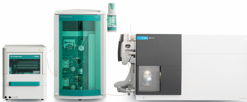
Figure 1. Instrumental setup to measure haloacetic acids, dalapon, and bromate including an 889 IC Sample Center – cool (Metrohm), 940 Professional IC Vario (Metrohm), and 6475 Triple Quadrupole LC/MS with Jet Stream Technology Ion Source (Agilent). A Dosino was used for direct infusion to the MS during method optimization.