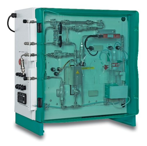
Fig. 1: The 875 KF Gas Analyzer, which was used for the determination