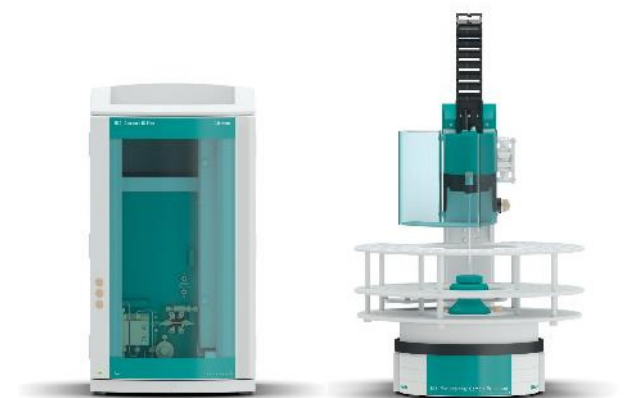
Figure 1. Instrumental setup including a 930 Compact IC Flex Oven and an 858 Professional Sample Processor.

Sample solutions are prepared from commercially available potassium bicarbonate and potassium chloride effervescent tablets for oral solution. Standard analyses are performed with a solution of USP Potassium Chloride RS. No additional sample preparation is required.