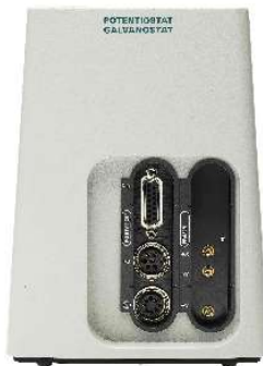
Figure 2 – The Metrohm Autolab PGSTAT204, equipped with the FRA32M module.

For the EIS measurements, a Metrohm Autolab PGSTAT204 equipped with a FRA32M module is used (Figure 2).