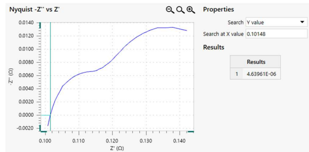
Figure 4 - The Interpolate command on the Nyquist plot related to the four-terminal sensing EIS measurement.

The Interpolate command present in the NOVA software allows such calculations to be performed easily, Figure 4.