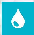
Liquids and pastes