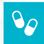
Food and pharmaceuticals