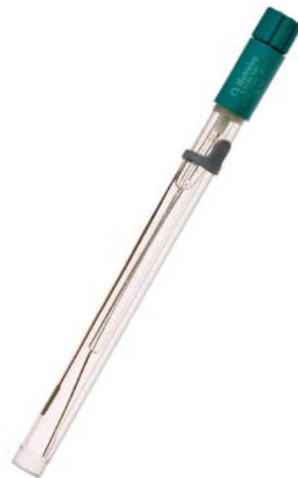
Predestined for the fully automatic titration of small volumes: the new 6.0256.100 flat membrane electrode with a fixed ground-joint diaphragm.